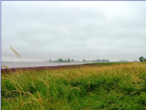
The tidal flats of Île Lebel in the St. Lawrence River

Repentigny is located on the shores of the St. Lawrence River and the Assomption River, east of the Island of Montréal. Its geographical position is very advantageous because of its proximity to the Island of Montréal. It has seven beaches on its two rivers, and a sector of the city has been named Repentigny-les-Bains.