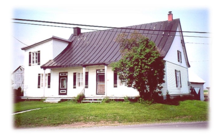
This lot from Saint-Roch-de-l'Achigan remains in the Archambault line for several generations.

The house at 565, rang Rivière Nord in Saint-Roch-de-l'Achigan