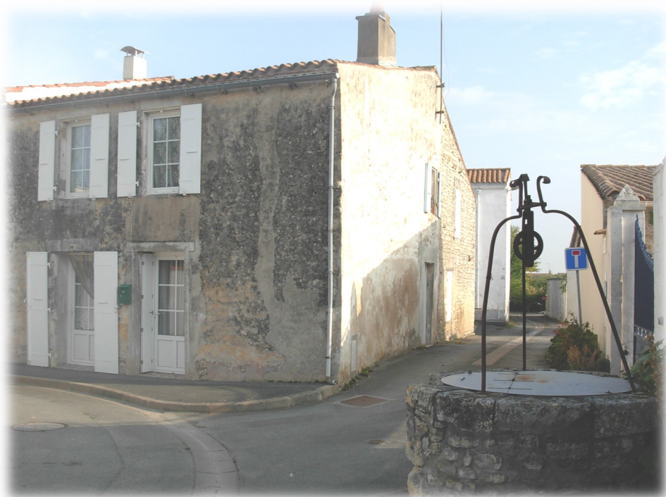
House of ancestor Jacques Archambault in Saint-Xandre, France Photo Louis Archambault, 2016

Archambault Houses by Pierre Archambault, member no. 007 Number 1